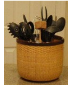
Large Utensil 10" Large Utensil $234.25

The Antique Tray Set The antique tray set consists of three beautiful round moulds; they are 10', 12", and 14 inches in diameter. The one shown at the left is the 12" round tray made on the 12" antique mould. Make one or the set! They are made of hardwood for the base and rims and cane for the stakes and weavers.