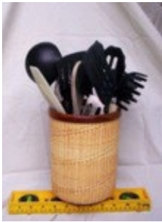
Small Utensil 6" Small Utensil $105.00

The Utensil Nantucket is one of the easiest and most useful Nantucket's to have and make. They come in 3 sizes: 6", 8" and 10" and are made with hardwood and cane. To weave the 10" please call Denise. The 8" and 10" are nail on rims