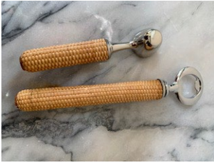
Bottle open and/or coffee Scoop