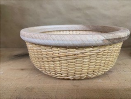
New tray $100.00