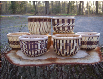
The newest baskets in the design workshop

If you choose a bowl with lid, consider having your knob scrimmed. Contact us to discuss this so your knob is ordered early and arrives in time for the Retreat.