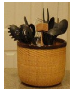
Large Utensil 10" Large Utensil $234.25