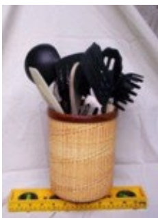
Small Utensil 6" Small Utensil $105.00

The Utensil Nantucket is one of the easiest and most useful Nantucket's to have and make. They come in 3 sizes: 6", 8" and 10" and are made with hardwood and cane. To weave the 10" please call Denise. The 8" and 10" are nail on rims 2 days