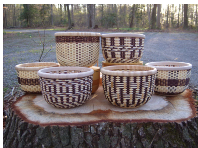
The newest baskets in the design workshop

If you choose a bowl with lid, consider having your knob scrimmed. Contact us to discuss this so your knob is ordered early and arrives in time for the Retreat.