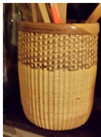
Jude's Utensil 8" Jude's Utensil $155.50